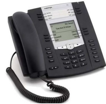
Quick Start Guide for Aastra 6755i